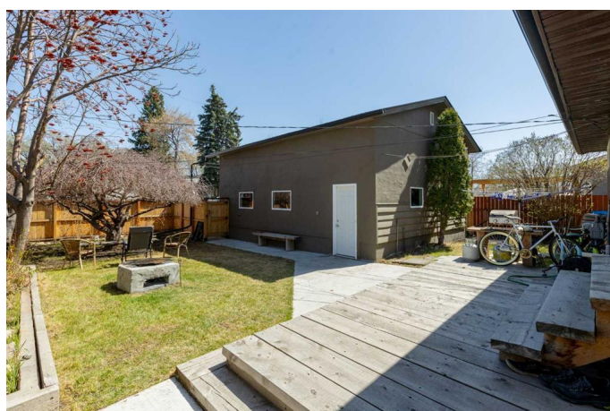
7032 22a St SE, Calgary, AB