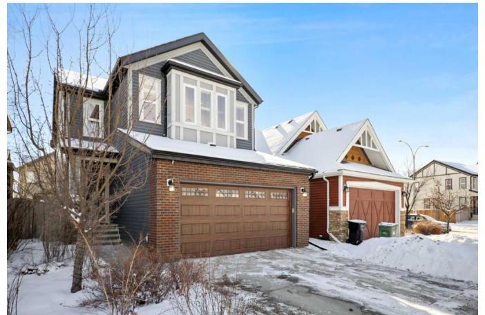
66 COPPERPOND HEATH SE

Family Approved - five bedrooms + two dens ** Extensive upgrades and superior quality, with 3500 square feet of air-conditioned luxurious living space. You will be impressed with the privacy of an oversized traditional homesite with a private south-facing backyard with a bespoke 13' x 12' covered deck. This seasonal, airy design provides relief from the sunniest to the snowiest days while providing an uninterrupted view of the surrounding gardens. Enjoy this convenient Copperfield Location - Steps away from the ponds, Ice rink, parks, pathways, schools, shopping, soccer, skate park, health care, transit, South Pointe Hospital, and the major south expressways. Living a community lifestyle makes Copperfield an outstanding, safe, and secure community. Rich curb appeal with architectural features - dramatic roof lines, 24' x 21' attached garage with wood-style detailed door & full-sized concrete driveway, covered entry, and brick-faced front complete this spectacular elevation. There are extensive upgrades throughout, and the details are superb. This is a must-see home! Chef's™ kitchen includes granite countertops, custom light wood shaker style cabinets/doors, extension trims, high-end KitchenAid stainless steel fridge/dishwasher/microwave/wall oven, gas cooktop range with 5 burners, recessed lighting, oversized central island, peninsula island with a flush eating bar & black granite under mount sink, extra cabinet storage & a